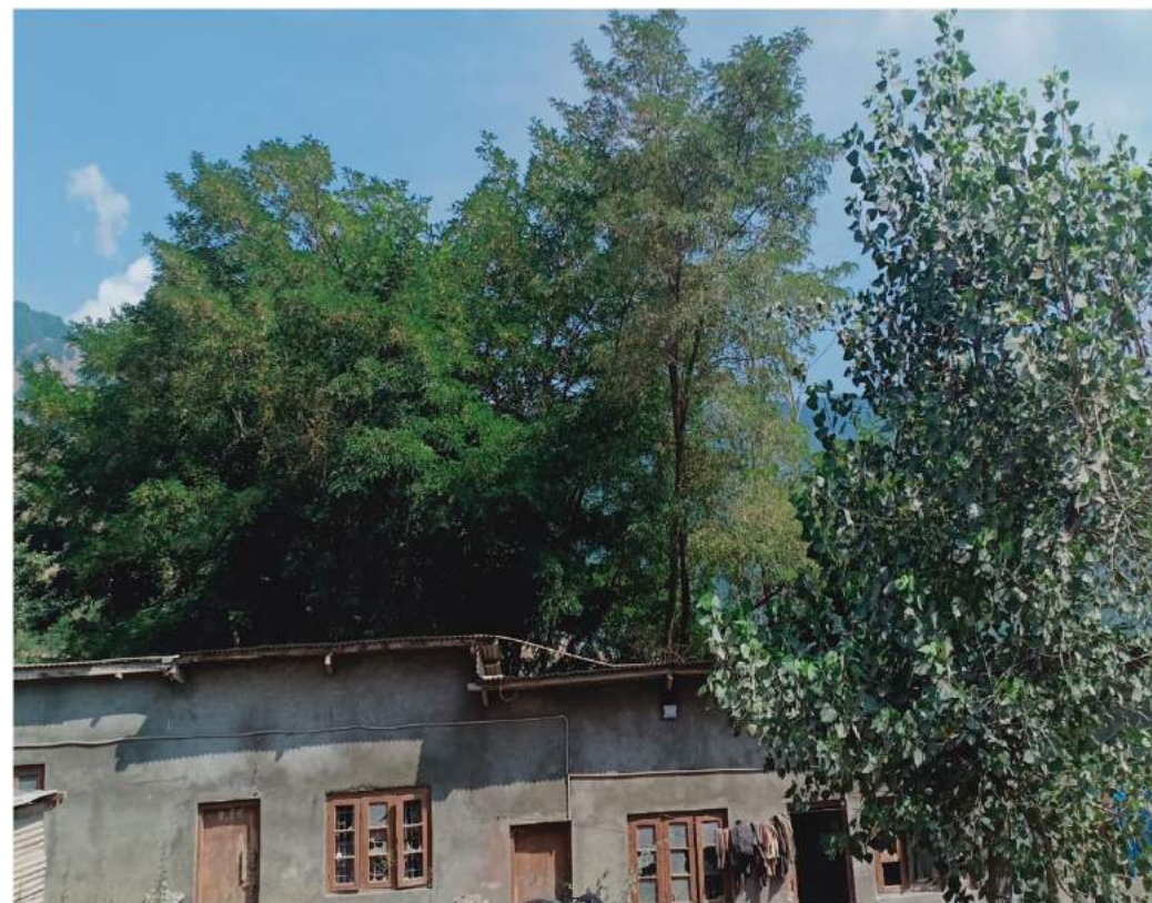
Fig.-1.14 Plantation near the quarters