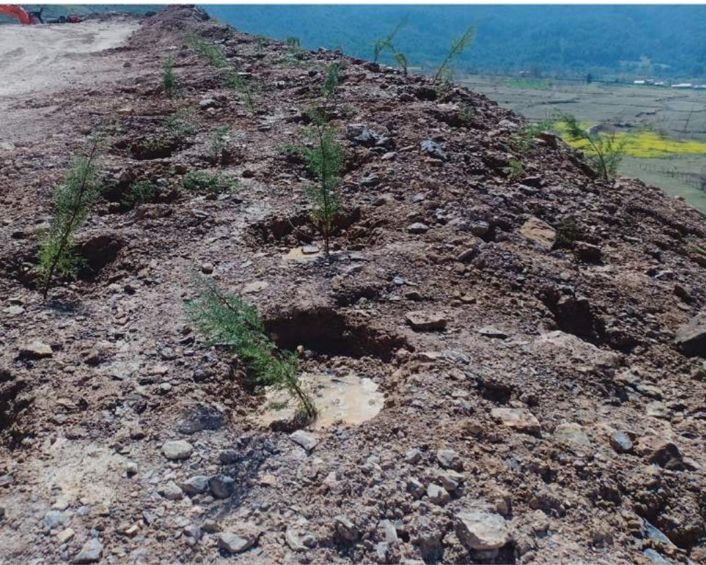
Fig.-1.11 New Green belt development