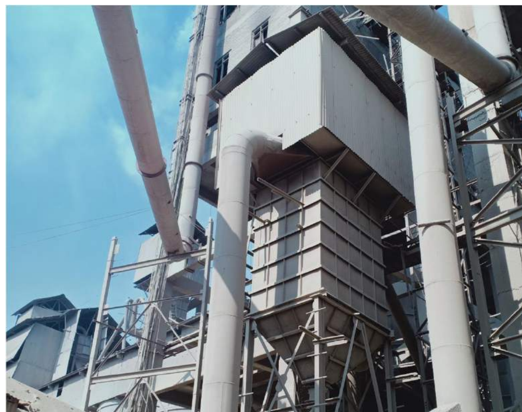
Fig.-1.8 Dust collectors attached to Clinker crusher