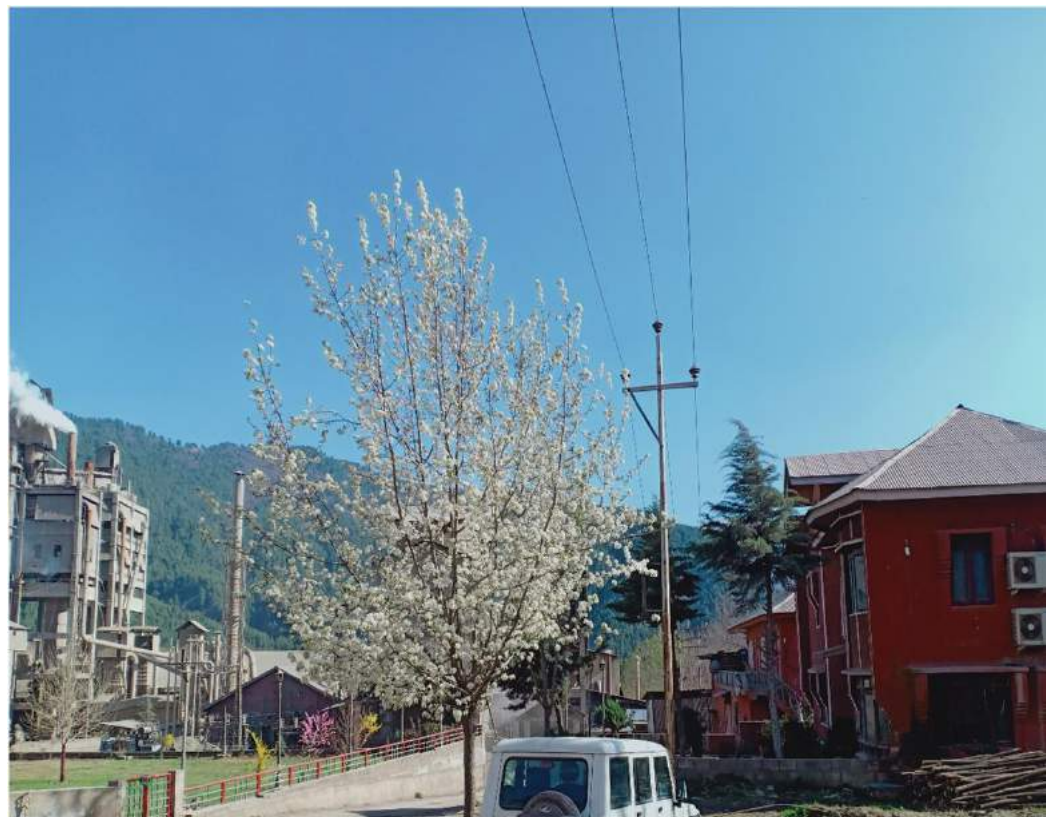
Fig.-1.6 Front view of the office park