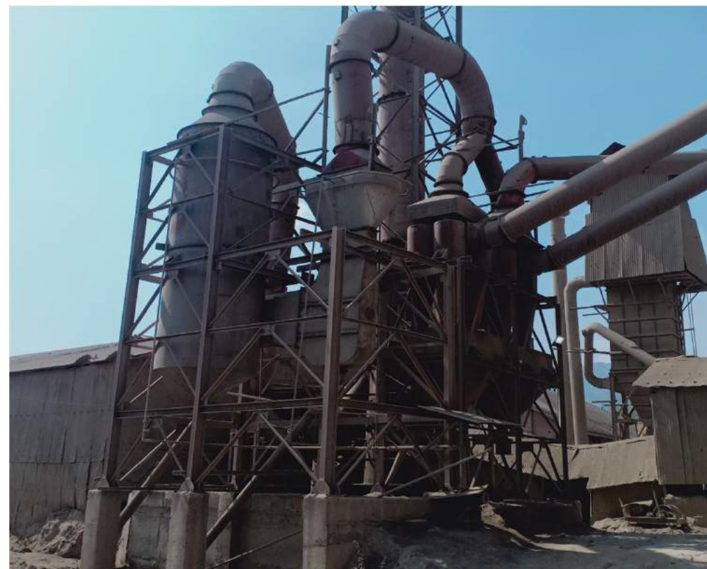
Fig.-1.2 VSK Wet Scrubber System