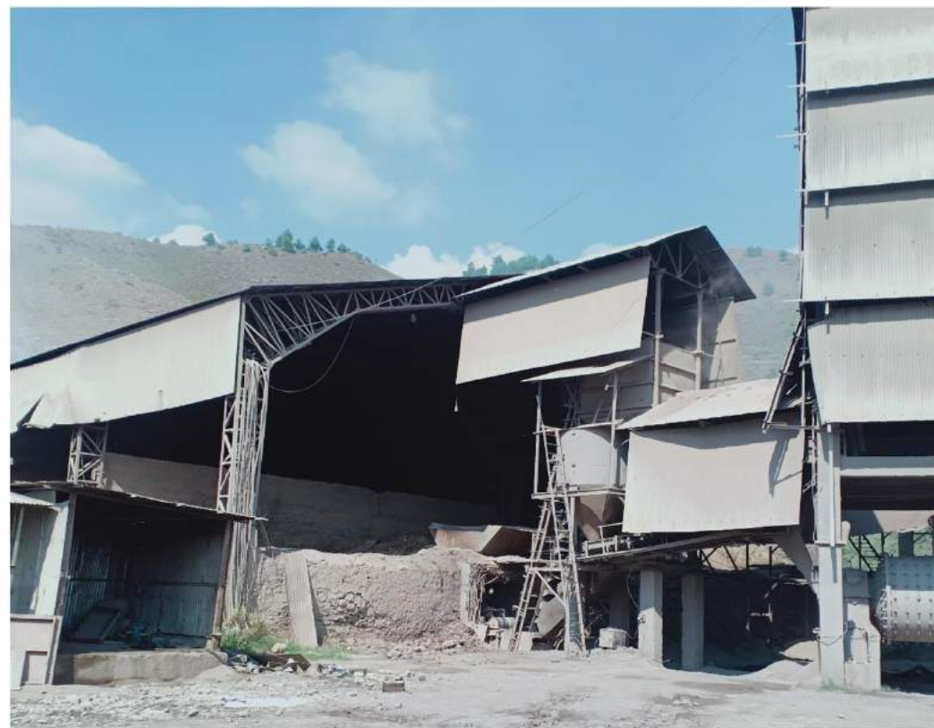
Fig.-1.18 Covered Raw mill crusher