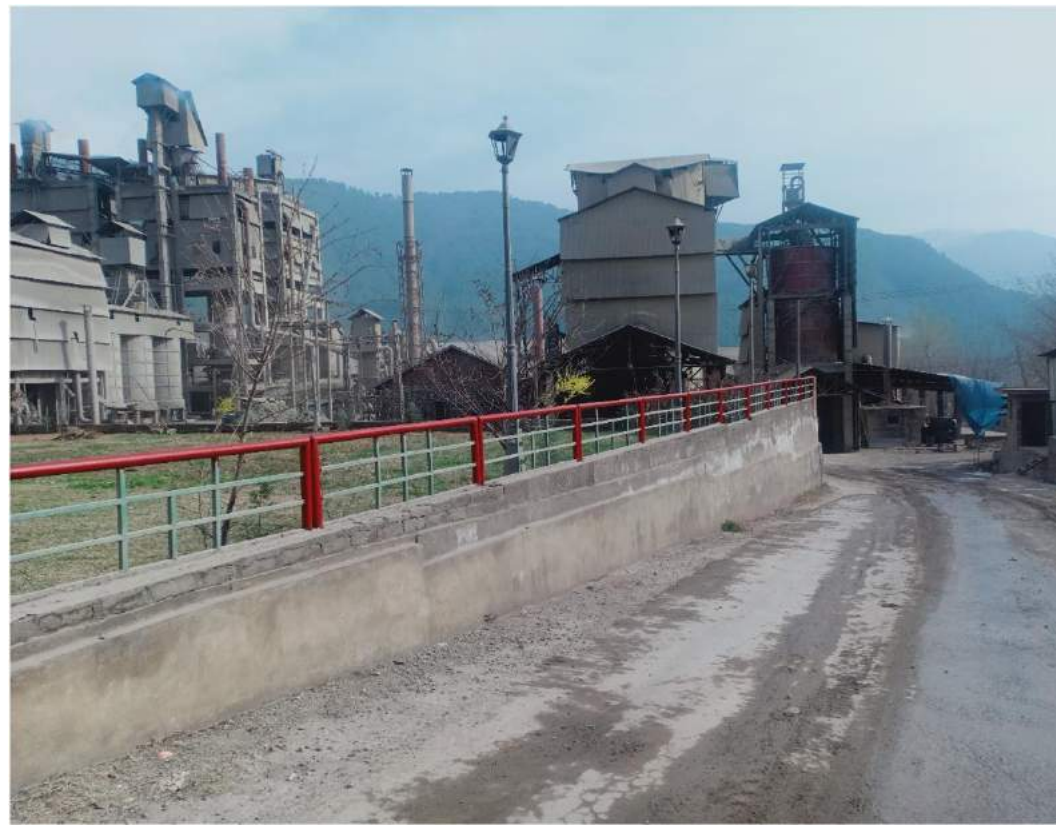
Fig.-1.20 Water sprinkling on the roads