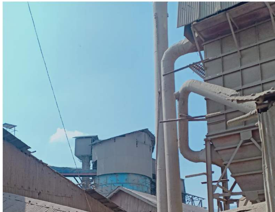
Fig.-1.16 Covered Cement silos