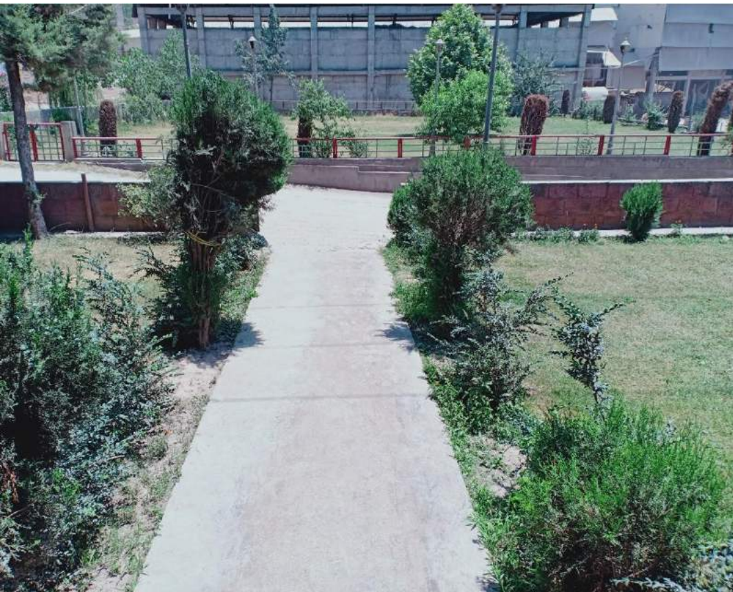
Fig.-1.3 Development of Green park in front of the Office