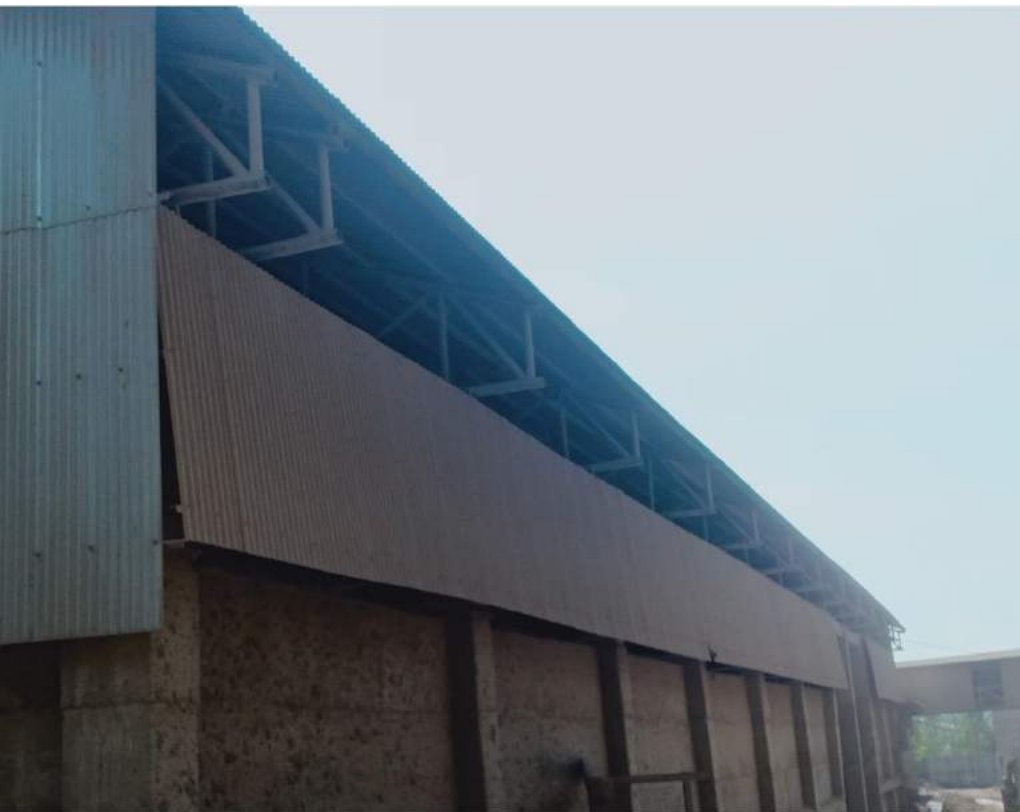
Fig.-1.15 Clinker Storage sheds