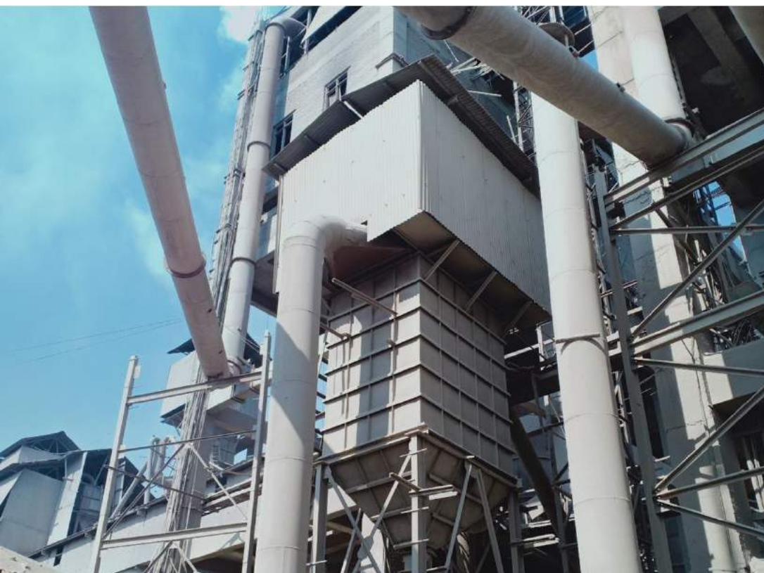
Fig.-1.1 Dust collector & VSK Wet Scrubber System