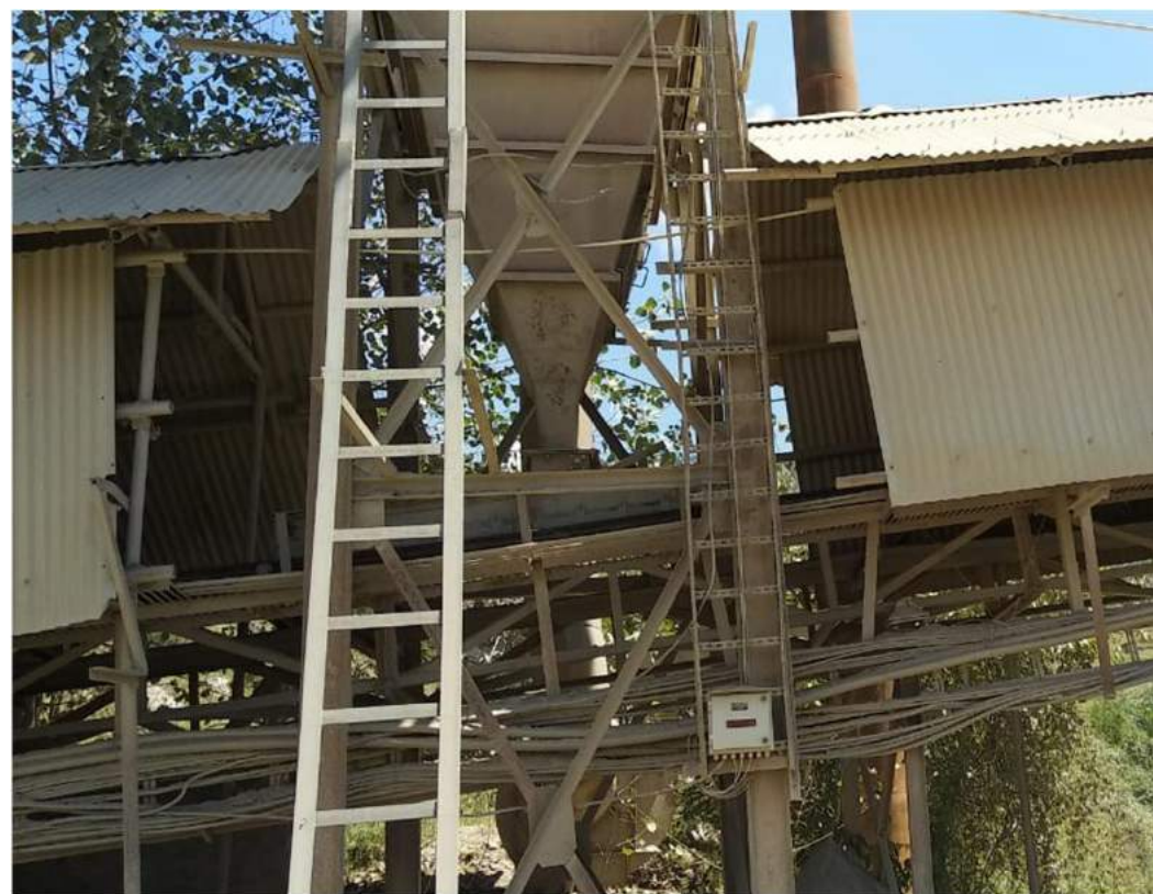
Fig.-1.10 Dust Collector attached to Crusher