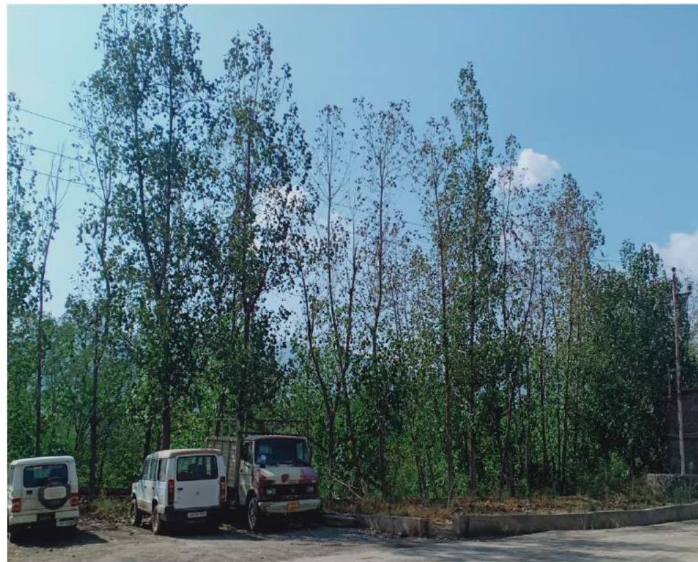
Fig.-1.12 Plantation along the road