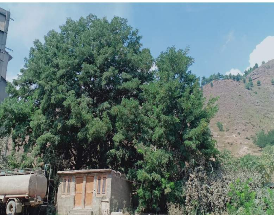
Fig.-1.5 Plantation behind the plant