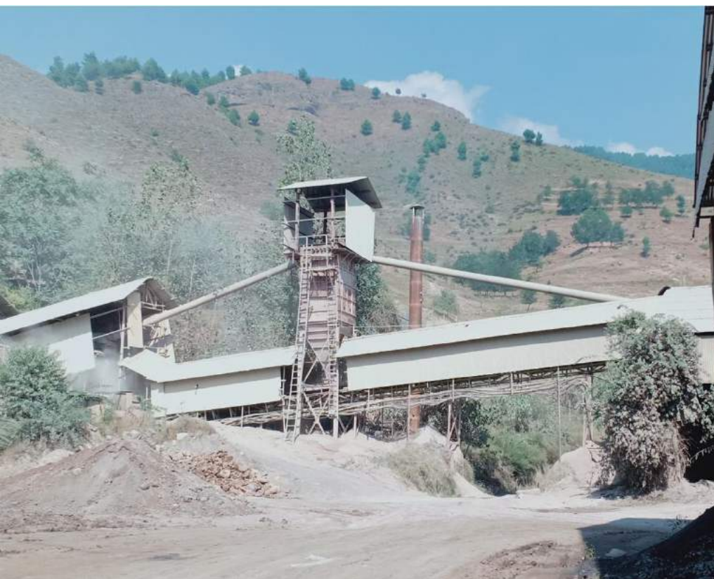
Fig.-1.19 Metal covered conveyors