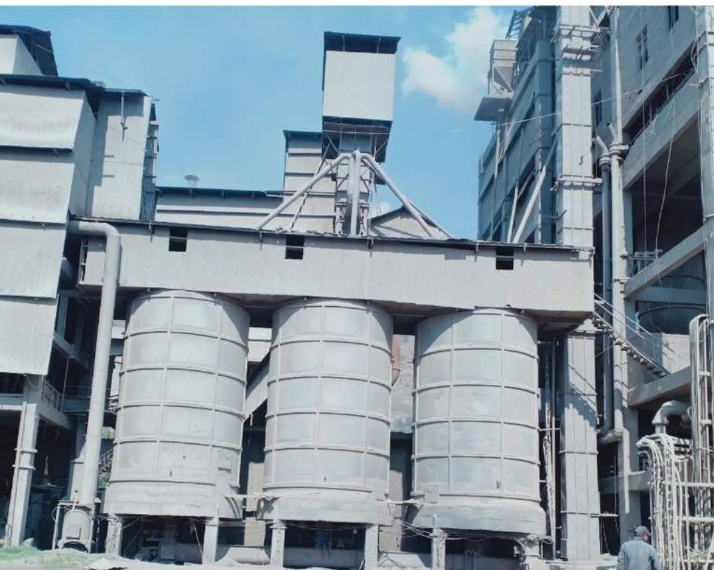
Fig.-1.17 Silos with bag filters