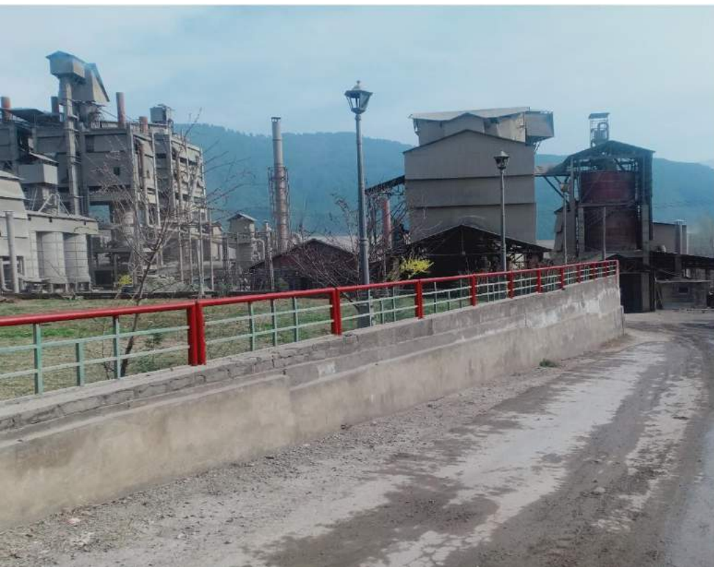
Fig.-1.7 Covered Cement mill and Silo