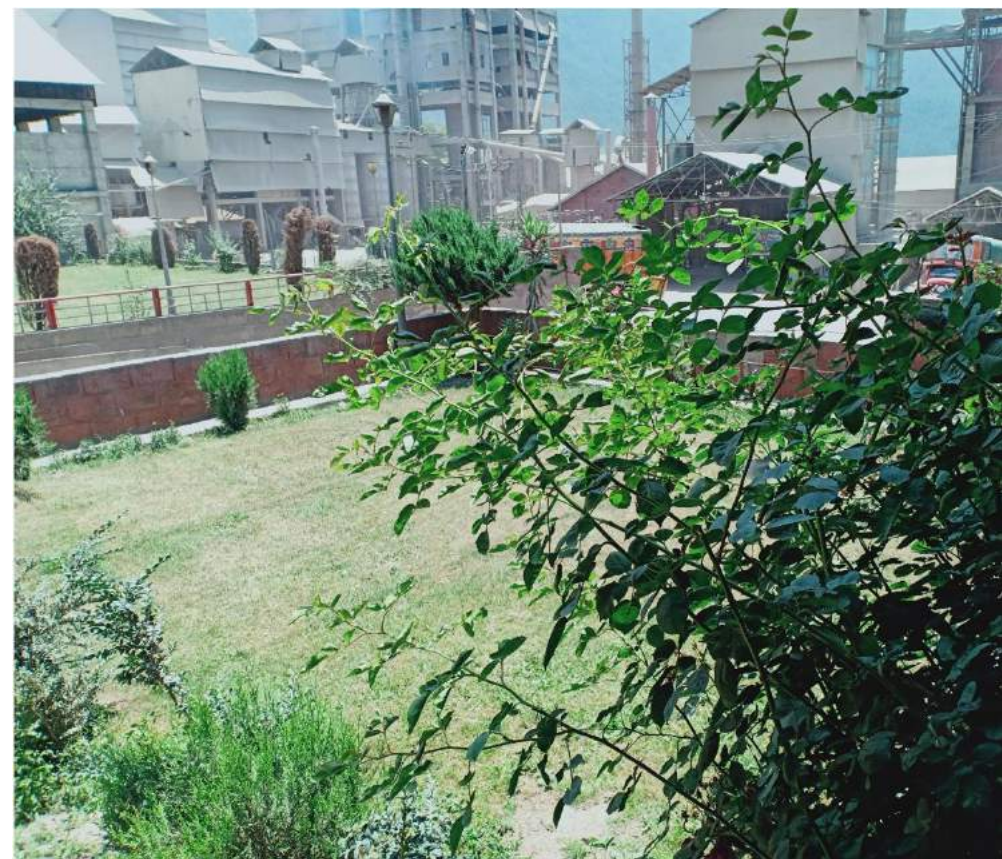
Fig.-1.4 Panoramic view of the plant