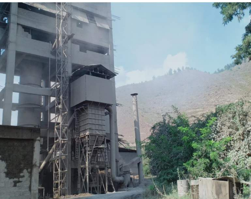
Fig.-1.9 Dust collectors installed