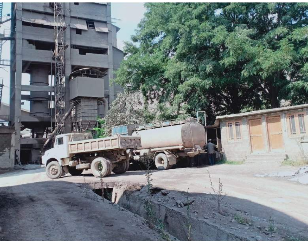
Fig.-1.13 Drainage system for Rain water collection